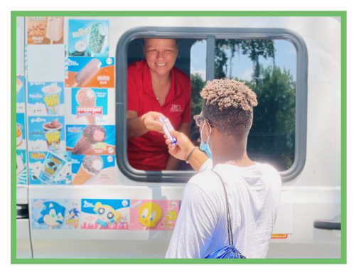
A fun afternoon on campus with the ice cream truck.