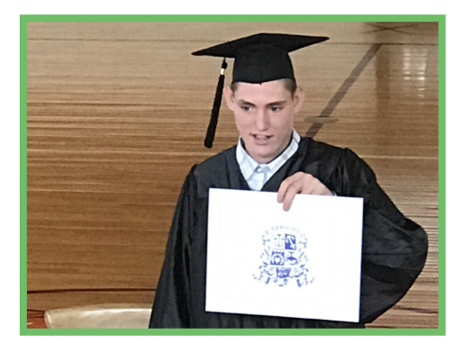
"Thank you to the staff for all they did for me."